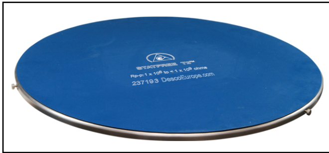
Figure 1. Desco Europe 237193 Gyro-Stat® ESD Bench Top Turntable

Made in the United Kingdom with Globally Sourced Materials