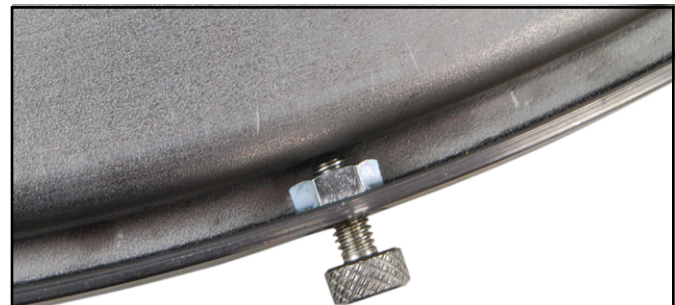
Figure 2. Thumbscrew Locks

*The Gyro-Stat® Bench Top Turntable may also be used on a floor or other surface. In order to be grounded it must be on a surface that provides a path to ground.