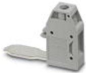
Pick-off terminal block, Connection method: Special and hybrid connection, Cross section: 0.5 mm 2 - 10 mm 2 , AWG: 20 - 8, Width: 10.2 mm, Height: 34.7 mm, Color: gray, Mounting type: On base element

Pick-off terminal block - AGK 10-UKH 150/240 - 3003554