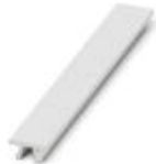
Zack marker strip, Strip, white, unlabeled, can be labeled with: Plotter, Mounting type: Snap into tall marker groove, for terminal block width: 22 mm, Lettering field: 10.5 x 21.8 mm

Zack marker strip - ZB 22:UNBEDRUCKT - 0811862