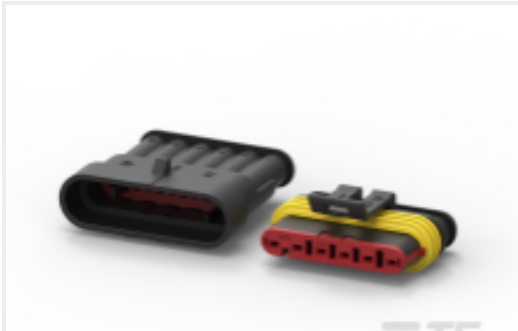
TE Part #CAT-AM71-CH8172 AMP SUPERSEAL 1.5MM, CONNECTOR HOUSING