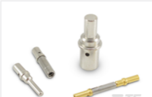
TE Part #CAT-D48-ST273 DEUTSCH Solid Contacts