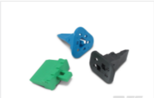
TE Part #CAT-D487-W416 Wedgelocks: DEUTSCH DT