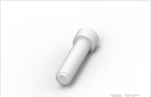
TE Part #114017-ZZ SEALING PLUG, SIZE 12/16, WHT