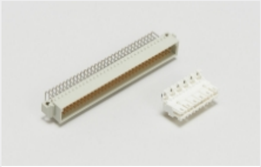
Standard Edge Connectors(3)