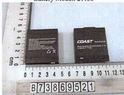
Battery Model: 21135