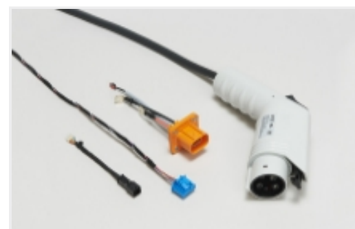
Electric, Hybrid & Fuel Cell Cable Assemblies(13)