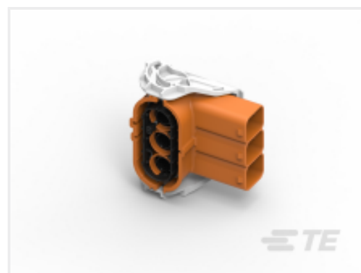
TE Part # 1-2141166-2 3POS,8MM HV,REC HSG,90DEG,ASSY, SEALED