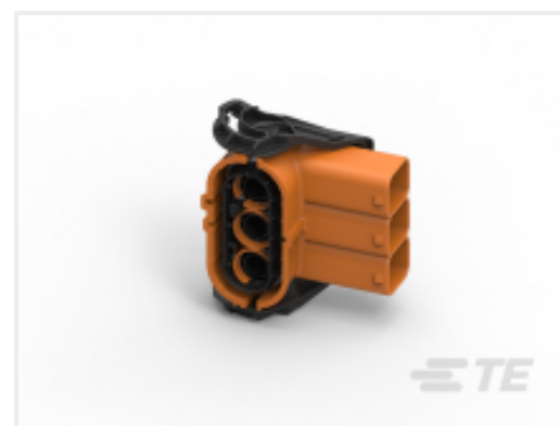
TE Part # 1-2141166-1 3POS,8MM HV,REC HSG,90DEG,ASSY, SEALED