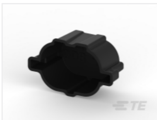
TE Part # 9-2208100-1 PROTEC. COVER 8MM HV,2POS PINHEADER