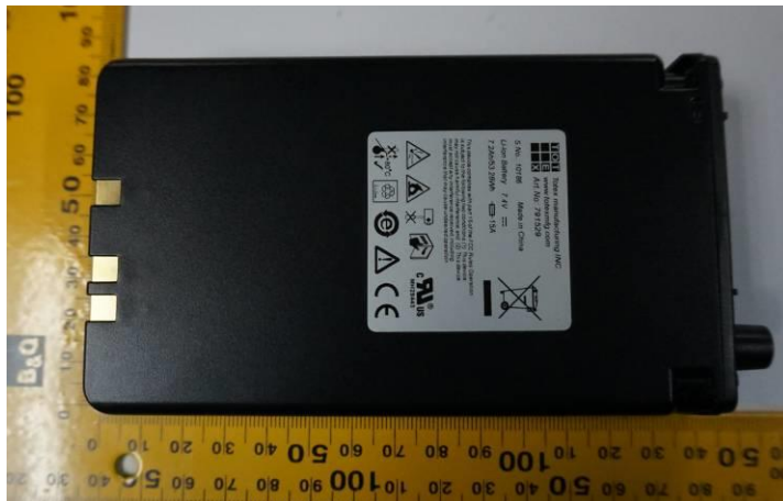
电池图片 Battery picture