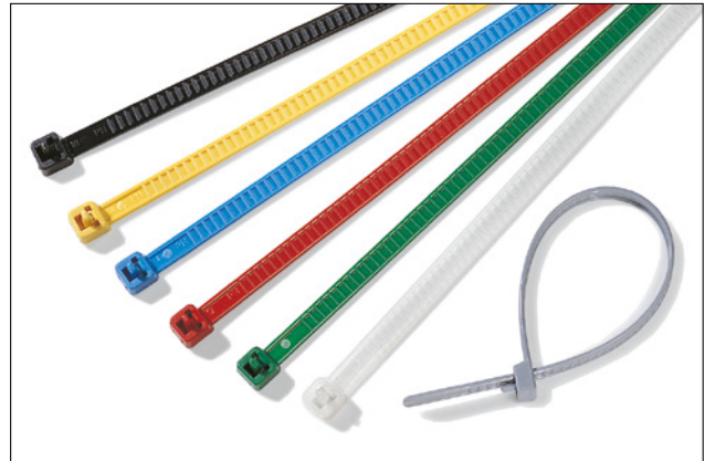
The LR55 cable ties are reusable and ideal for colour coding.