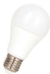
146576 LED Industry A60 E27 8W (66W) 900lm 830 100V-260V AC/DC