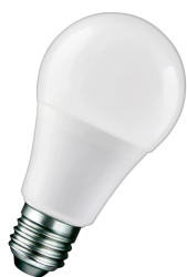
145630 LED Industry A60 E27 9.5W (83W) 1200lm 840 100V-260V AC/DC