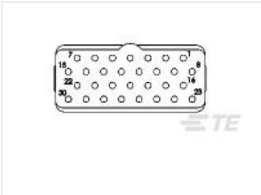
TE Part #1738171-1 INSERT ASY,PIN,E,30-P,KEY B