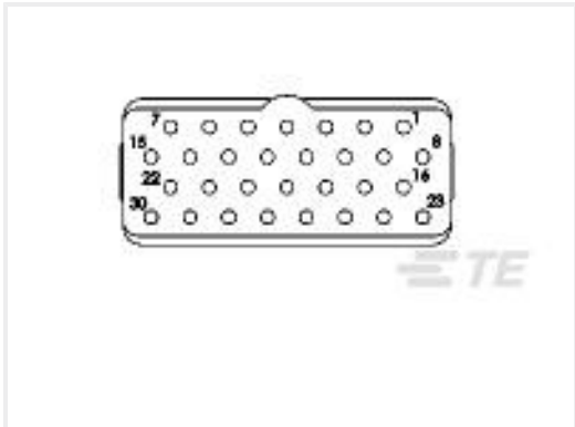
TE Part #1738169-1 INSERT ASY,SOCKET,E,30P,KEY A