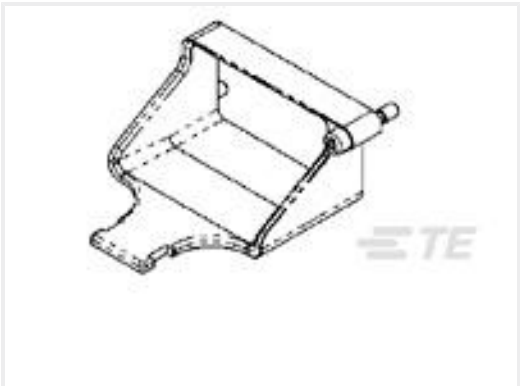
TE Part #1738310-1 STRAIN RELIEF KIT,STRT,GPRB1