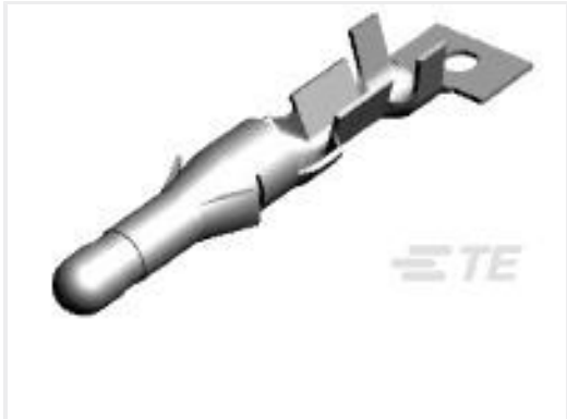
TE Part #770147-1 .093 CP&S PIN PTPBR LP 24-18