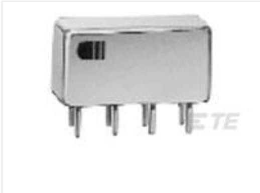
TE Part #3-1617033-1 HFW1230K06P = M39016/6-105P