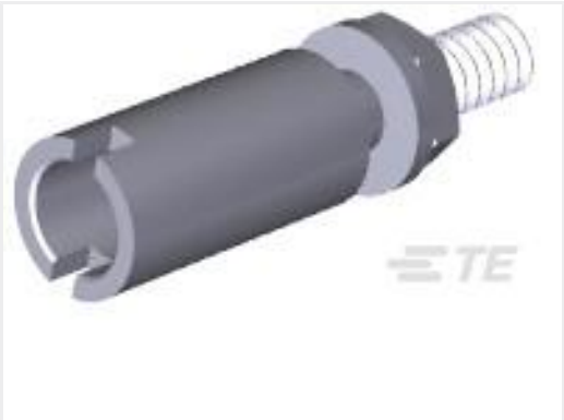
TE Part #1-200835-1 SERIES"M" MIN. RECT. GUIDE SOC