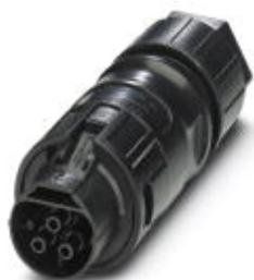
PRC connector, black, 3-pos., 1.5 mm 2 ... 6 mm 2 /630 V/35 A, with screw connection, for cables with a diameter of 16 mm ... 21 mm.

Please be informed that the data shown in this PDF Document is generated from our Online Catalog. Please find the complete data in the user's documentation. Our General Terms of Use for Downloads are valid ( http://phoenixcontact.com/download )