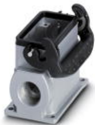
HEAVYCON box mounting base B10, with single locking latch, height 52 mm, with support 1xM25

Please be informed that the data shown in this PDF Document is generated from our Online Catalog. Please find the complete data in the user's documentation. Our General Terms of Use for Downloads are valid ( http://phoenixcontact.com/download )