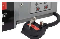
OPERATES FROM A 13A SUPPLY FOR EASE-OF-USE