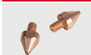
SUPPLIED WITH REPLACEMENT 16MM COPPER/CHROME ELECTRODES