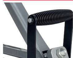
HEAVY-DUTY CARRY HANDLE FOR WORK AREA MOVEMENT