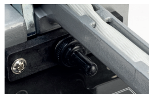
FITTED WITH A HEAVY-DUTY WELD SWITCH FOR RELIABLE OPERATION