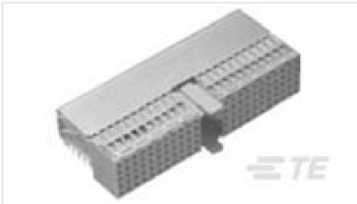
TE Part #5100147-1 Z-PACK/A RAF 110P