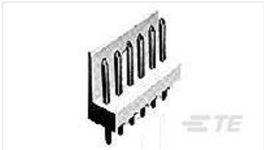
TE Part #171825-6 POST HDR ASSY VERT AMP EI CONN