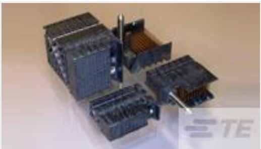
TE Part #2057417-1 IMP100S,R,RA4P8C,UG,39