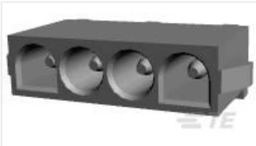
TE Part #350430-1 04P UMNL PIN HDR ASSY NATL