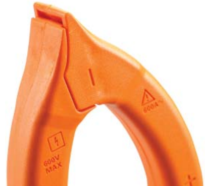
Figure 1. The unique wire separator allows you to separate and measure individual wires more easily

Ergonomically built, the U1190 Series clamp meters fit comfortably in the palm of your hand and allow you to select measurement functions with just a simple thumb press. Better yet, the U1193A and U1194A come with a current measurement up to 600 A. The wide range of current measurement functions cover an array of applications such as electrical installation, maintenance, and troubleshooting tasks—making it an ideal tool to use across many industrial applications.