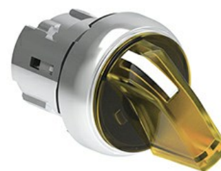
Illuminated selector switch actuator - 3 position LPSSL13