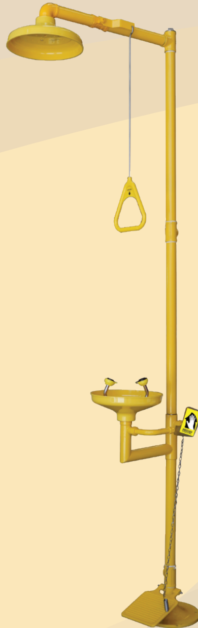
PG 10022 AB