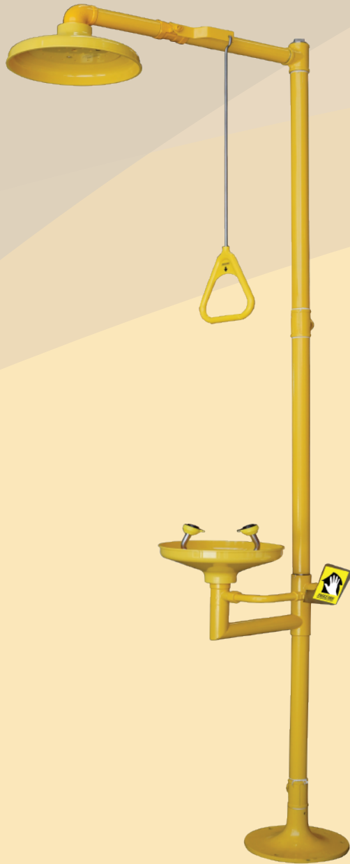
PG 10020 AB