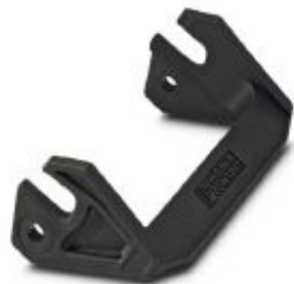
Single locking latch for B16 housing, HC-EVO...AL and HC-STA...AL

Please be informed that the data shown in this PDF Document is generated from our Online Catalog. Please find the complete data in the user's documentation. Our General Terms of Use for Downloads are valid ( http://phoenixcontact.com/download )