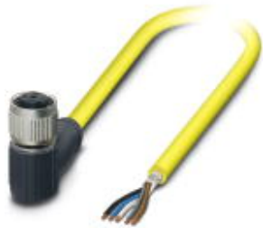
Sensor/Actuator cable, 5-position, PVC, Yellow RAL 1021, shielded, Free cable end, on Socket angled M12 SPEEDCON, A-coded, Cable length: 10 m

Please be informed that the data shown in this PDF Document is generated from our Online Catalog. Please find the complete data in the user's documentation. Our General Terms of Use for Downloads are valid ( http://download.phoenixcontact.com )