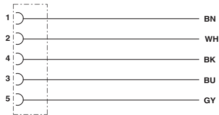
Contact assignment of the M12 socket