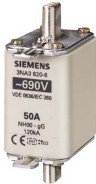
LV HRC fuse element, NH00, In: 50 A, gG, Un AC: 690 V, Un DC: 250 V, Front indicator, live grip lugs