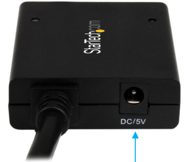
Power Adapter Port