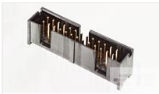
TE Part #5103308-7 A/L LOW PRO HDR 34P VERT BLACK