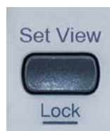
The key lock function prevent DUTs from unnecessary damages caused by mis-operation.

The RPE-X323 series has a built-in set view and key lock so as to expedite the operation process. The key lock function protects DUTs by preventing others from changing Voltage/Current parameters.