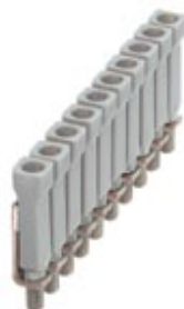
Jumper, Number of positions: 10, Color: gray

Please be informed that the data shown in this PDF Document is generated from our Online Catalog. Please find the complete data in the user's documentation. Our General Terms of Use for Downloads are valid ( http://download.phoenixcontact.com )