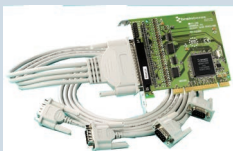
UC-346: uPCI 4xRS422/485 1MBaud