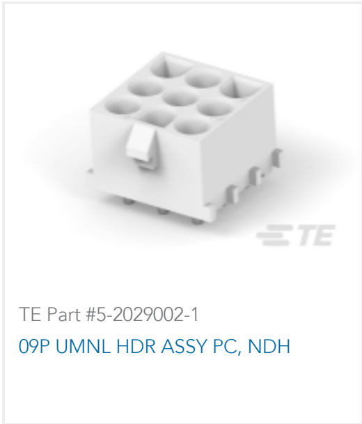
TE Part #5-2029002-1 09P UMNL HDR ASSY PC, NDH