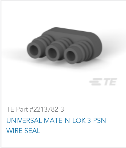
TE Part #2213782-3 UNIVERSAL MATE-N-LOK 3-PSN WIRE SEAL