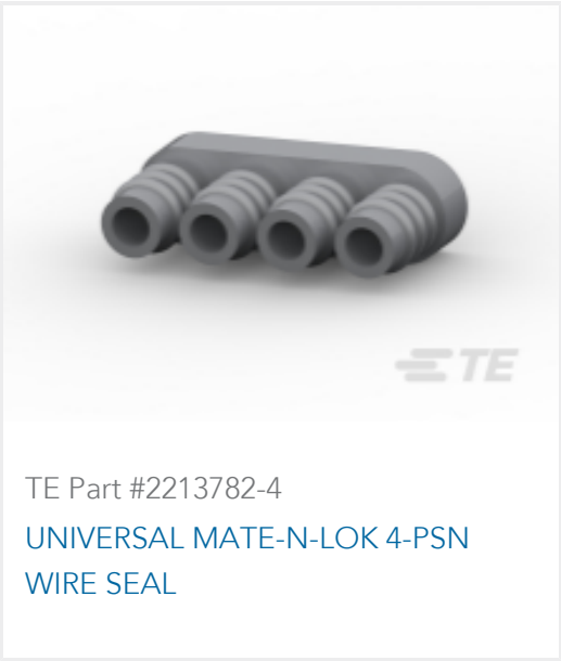
TE Part #2213782-4 UNIVERSAL MATE-N-LOK 4-PSN WIRE SEAL