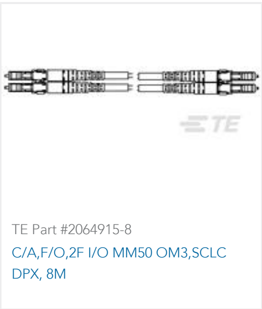
TE Part #2064915-8 C/A,F/O,2F I/O MM50 OM3,SCLC DPX, 8M