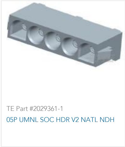
TE Part #2029361-1 05P UMNL SOC HDR V2 NATL NDH