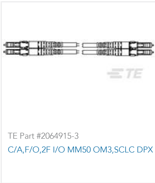
TE Part #2064915-3 C/A,F/O,2F I/O MM50 OM3,SCLC DPX