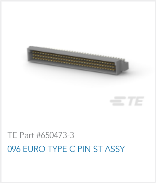
TE Part #650473-3 096 EURO TYPE C PIN ST ASSY