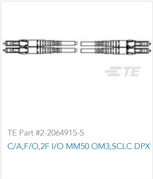
TE Part #2-2064915-5 C/A,F/O,2F I/O MM50 OM3,SCLC DPX