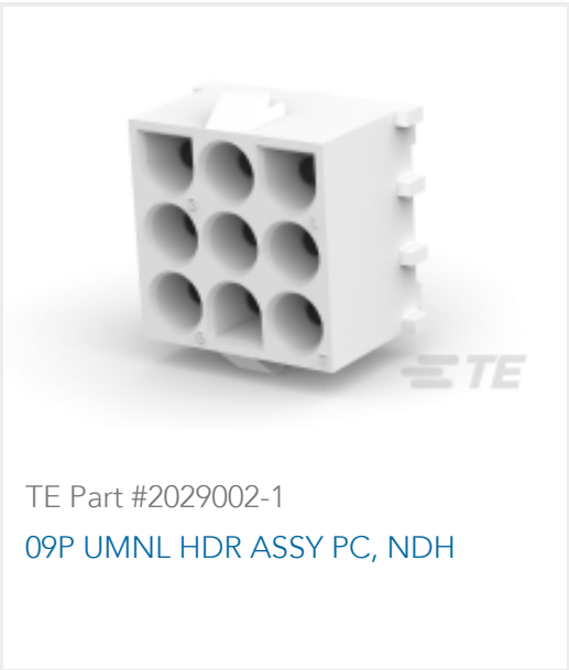
TE Part #2029002-1 09P UMNL HDR ASSY PC, NDH