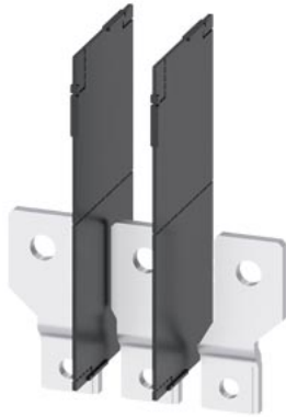
bus connector offset front 3 units accessory for: 3VA2100/160/250