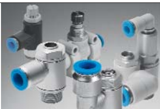
Choice of products

One-way flow control valves are used to control flow rates for the advance or return strokes of cylinders. This in turn allows the piston speed to be controlled. The one-way flow control valves GRLA-QS-B-20 allow precise control of flow rates and have already proved their worth in countless applications.