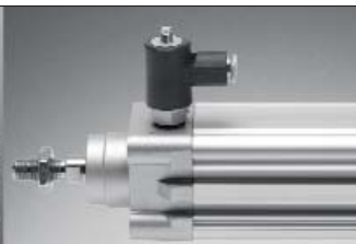
Flow as required