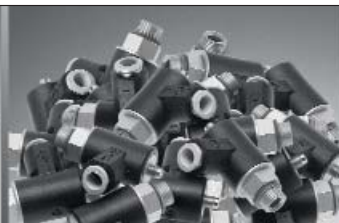
Economical bulk packs