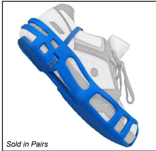
Sold in Pairs