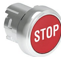
Pushbutton actuators, spring return, with symbol LPSB11