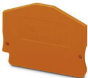
End cover, Length: 51 mm, Width: 2.2 mm, Height: 43 mm, Color: orange

Please be informed that the data shown in this PDF Document is generated from our Online Catalog. Please find the complete data in the user's documentation. Our General Terms of Use for Downloads are valid ( http://phoenixcontact.com/download )