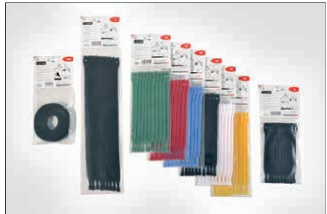
The TEXTIE-Series is available in different colours and lengths.