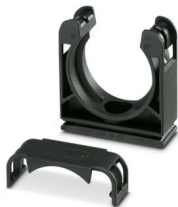
Hose holder with cover, material: PA, color: black, flammability rating in acc. with UL 94: V2

https://www.phoenixcontact.com/in/products/3240964