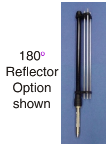
180° Reflector Option shown