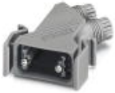
D-SUB sleeve housing, shell size 2, IP67 degree of protection

D-SUB sleeve housings - VS-15-T-2PG11 - 1688052