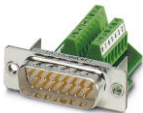
D-SUB contact insert, shell size 2, with 15 signal contacts, male type of contact, screw connection, straight, for panel mounting frame and sleeve housing with IP67 protection

Please be informed that the data shown in this PDF Document is generated from our Online Catalog. Please find the complete data in the user's documentation. Our General Terms of Use for Downloads are valid ( http://phoenixcontact.com/download )