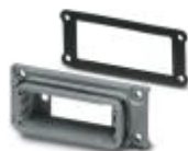
D-SUB panel mounting frame, shell size 2, IP67 degree of protection

D-SUB panel mounting frames - VS-15-A - 1688036