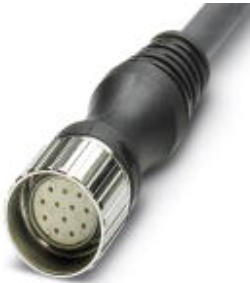
M23 socket, straight, 12-pos., with 5 m master cable, pin 9 and 10 bridged

Please be informed that the data shown in this PDF Document is generated from our Online Catalog. Please find the complete data in the user's documentation. Our General Terms of Use for Downloads are valid ( http://download.phoenixcontact.com )