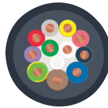
PUR/PVC black [PUR]