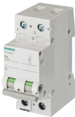
off switch 100A 2-pole