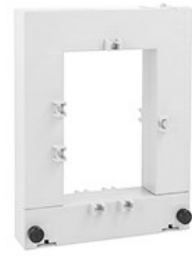
Current transformers DM3TA0800