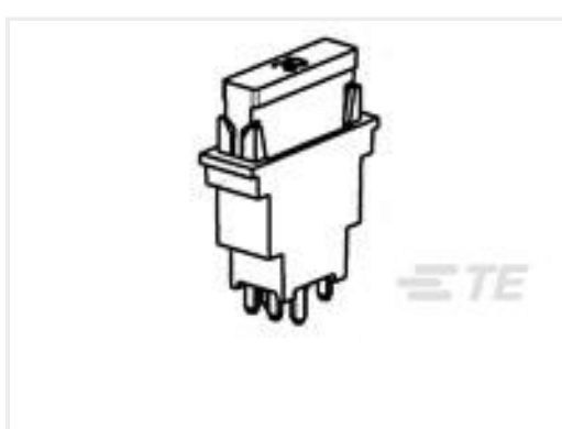
TE Part #1544550-1 MODULE AUTOFUSIBLE