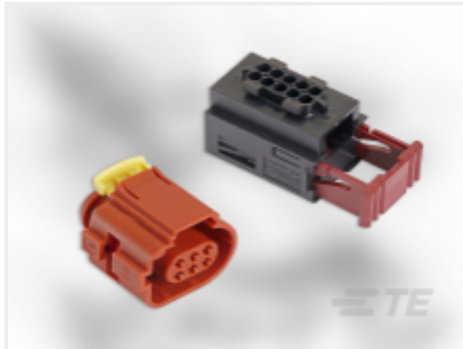
TE Part # CAT-T4827-CH8172 Timer Connector Housing