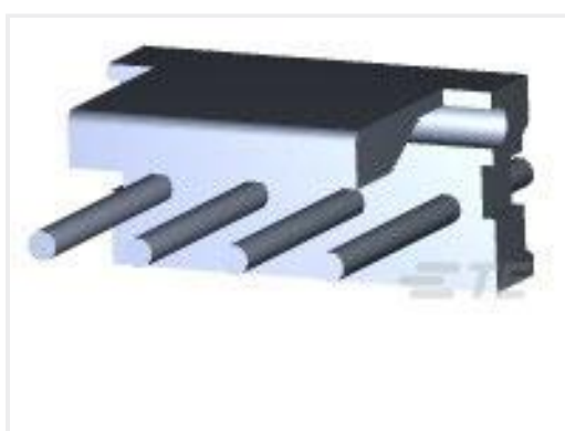
TE Part #640388-4 04P MTA156 HDR ASSY RN STR F/L