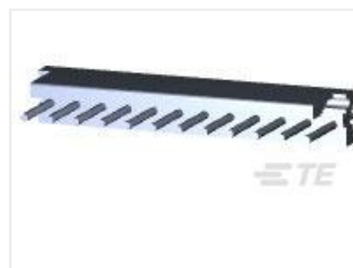
TE Part #1-640388-2 12P MTA156 HDR ASSY RN STR F/L