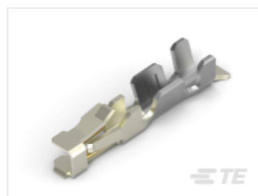
TE Part #3-2316113-4 2MM,REC,CNT,CRIMP,24-28AWG,0.1 UM,LP