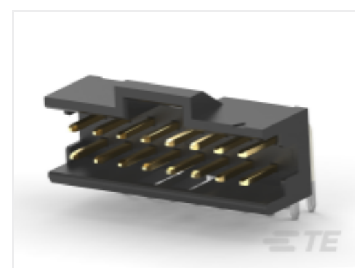
TE Part #2-2823411-4 24P,2MM,PL HDR,DRRT,2.8,0.76AU,TB