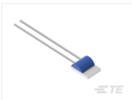
TE Part #NB-PTCO-006 Pt1000, 2.0x2.3, Class B, PTFC102B1G0