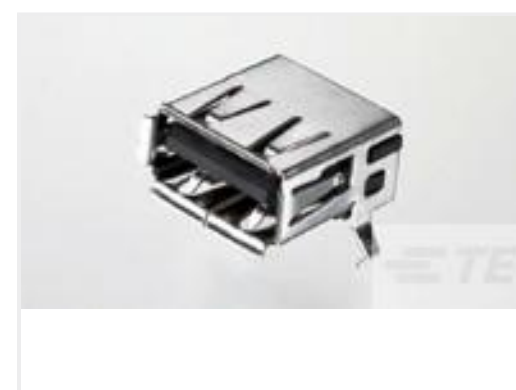
TE Part #1903814-1 INDUSTRIAL USB REC ASSY R/A 1ROW