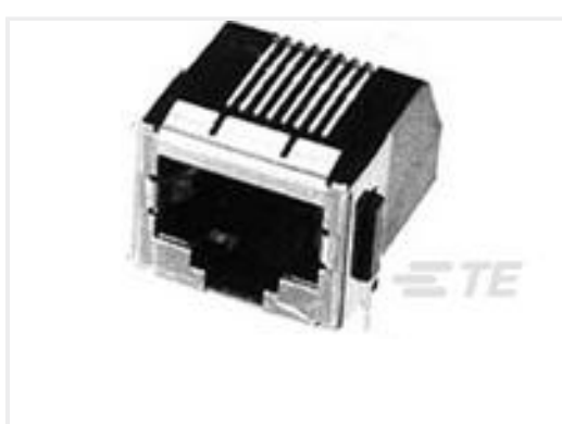
TE Part #5555153-1 MJ,LPF,R/A,8P,PCBG,PSTP.15TTR