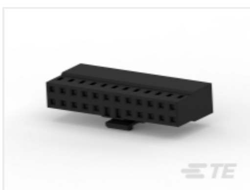
TE Part #2-2316110-4 24P,2MM,REC,HSG,DR,CRIMP,LATCH, BOX