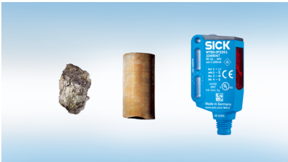
Rugged VISTAL™ housing offers maximum mechanical stability

The rugged VISTAL™ housing offers very high mechanical stability and therefore high sensor availability. The use of glass-fiber reinforced plastic combined with high-performance adhesives ensures excellent housing sealing and makes it resistant to cleaning agents. The laser inscription is easy to read even if the sensor has already been in use for years.