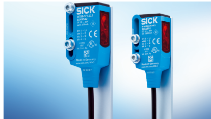
Housing variants for M3 and M4 fixing screws Slots make it possible to move the sensor on the screw