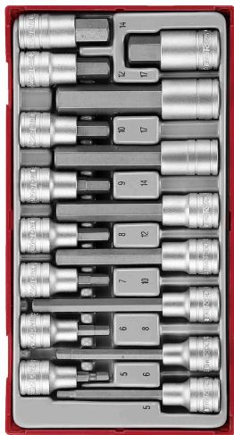
Socket Set 1/2" Drive Hex Bit 16 Pieces TT Tray