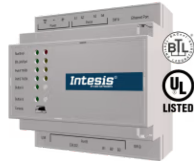
LonWorks TP/FT-10 to BACnet/IP & MS/TP - 100 points

Integrate any LON device or installation with a BACnet BMS or any BACnet/IP or BACnet MS/TP controller. This integration aims to make LON devices, their network variables (SNVT), and resources accessible from a BACnet-based control system or device as if they were a part of the BACnet system and vice versa.