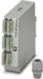
DIN rail splice box, fully mounted ready to splice, for 6x SC duplex (OM2)

Please be informed that the data shown in this PDF Document is generated from our Online Catalog. Please find the complete data in the user's documentation. Our General Terms of Use for Downloads are valid ( http://phoenixcontact.com/download )