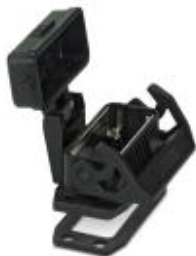
HEAVYCON EVO panel mounting base, plastic, D15, with single locking latch, with flat gasket, with protective cover

Please be informed that the data shown in this PDF Document is generated from our Online Catalog. Please find the complete data in the user's documentation. Our General Terms of Use for Downloads are valid ( http://phoenixcontact.com/download )