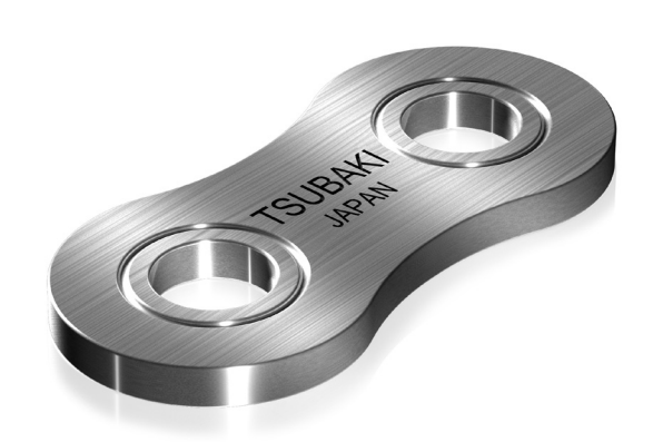
Fig. 13 Ring Coined Connecting Link Plate

The TSUBAKI Ring Coining process on the connecting link plate allows the chain to be specified up to its full kW rating.