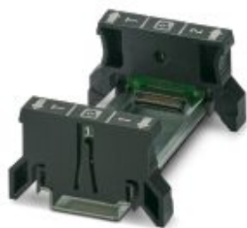
Axioline P terminator pair

Please be informed that the data shown in this PDF Document is generated from our Online Catalog. Please find the complete data in the user's documentation. Our General Terms of Use for Downloads are valid ( http://phoenixcontact.com/download )