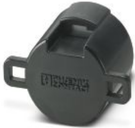
Protective cap for 3 and 5-pos. PRC device plugs

Please be informed that the data shown in this PDF Document is generated from our Online Catalog. Please find the complete data in the user's documentation. Our General Terms of Use for Downloads are valid ( http://phoenixcontact.com/download )