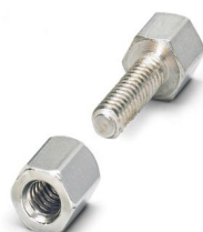
Mounting set, for DSUB gender changer contact inserts

Please be informed that the data shown in this PDF document is generated from our online catalog. Please find the complete data in the user documentation. Our general terms of use for downloads are valid.