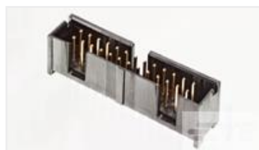
TE Part #1761681-3 IDC LOW PRO HDR 10P VERT HT BLACK