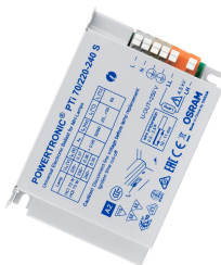
143482 POWERTRONIC INTELLIGENT PTi S 70/220...240 S