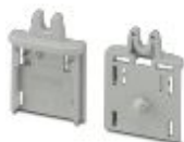
Adapter for direct mounting

Assembly adapters - PTFIX 1,5-RZF - 1050613